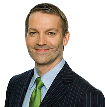
PAUL FEENEY CEO, OLD MUTUAL WEALTH

Old Mutual Wealth is committed to taking a leading role in creating and enhancing prosperity for this generation and those that follow. Achievement of this will require a collaborative approach from the savings and investment industry, policymakers and others. I believe that this research can provide a meaningful contribution to the debate and I hope it acts as a trigger for tangible action and progress to the achievement of prosperity for all.