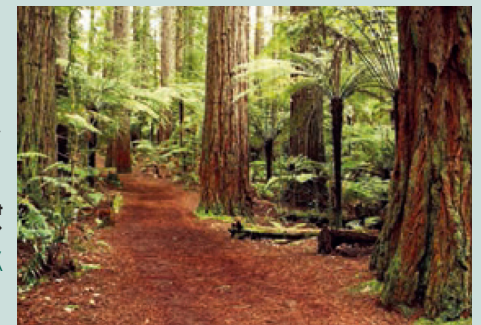
Redwood Forest Foundation → OM Asset Management affiliate, USA

Campbell Global is working with partners in the United States on environmental enhancement projects, including landscape restoration.